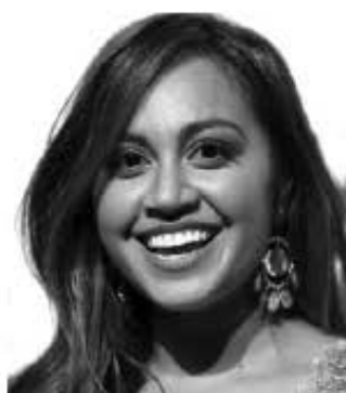
Jessica Mauboy Indigenous Recording Artist

NAIDOC Week Celebrations are held across Australia each July to celebrate the history, culture and achievements of Aboriginal and Torres Strait Islander Peoples