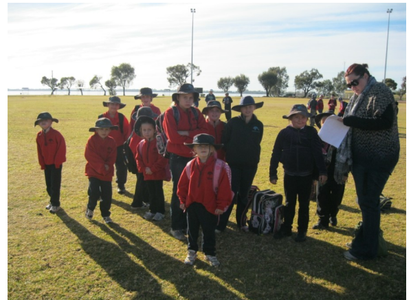
NAIDOC day fun

The knowledge gained from the meeting will be passed onto the parents at the next P&C meeting which will take place on Tuesday the 2nd of August at 3:30pm in the school staffroom. After the P&C meeting we will be able to begin the process of National Partnerships so we are ready to receive the bulk of the funding in 2012.